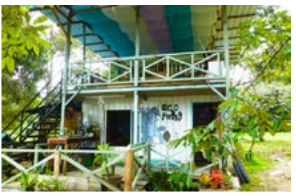
Traditional family-run, community farm-stay.