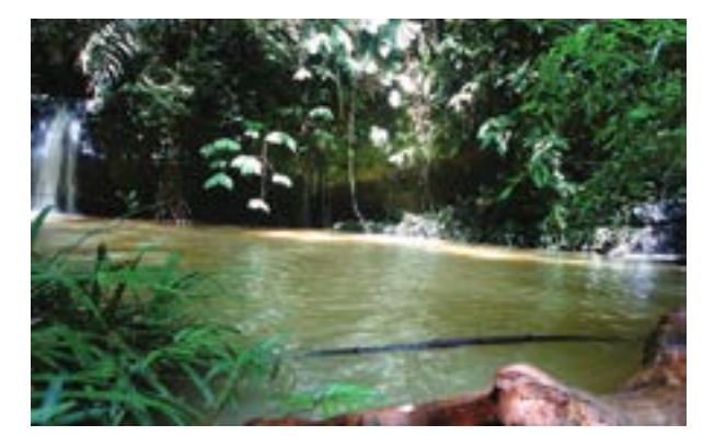
Bedanu Waterfall Recreational Park

Indulge yourself in the calming atmosphere of the village operated by the local village communities showcasing quality products made using traditional and modern methods and experience first-hand cultural activities alongside Kiudang villagers. Visitors will get the chance to experience several type of cultural activities such as handicraft making demonstration, herbal tea making, live cooking of traditional cakes, local fruit planting, Islamic activity showcase such as calligraphy demonstration and a visit to Ariffin Gallery which showcases various collection of antiques, handicrafts and traditional musical instruments.